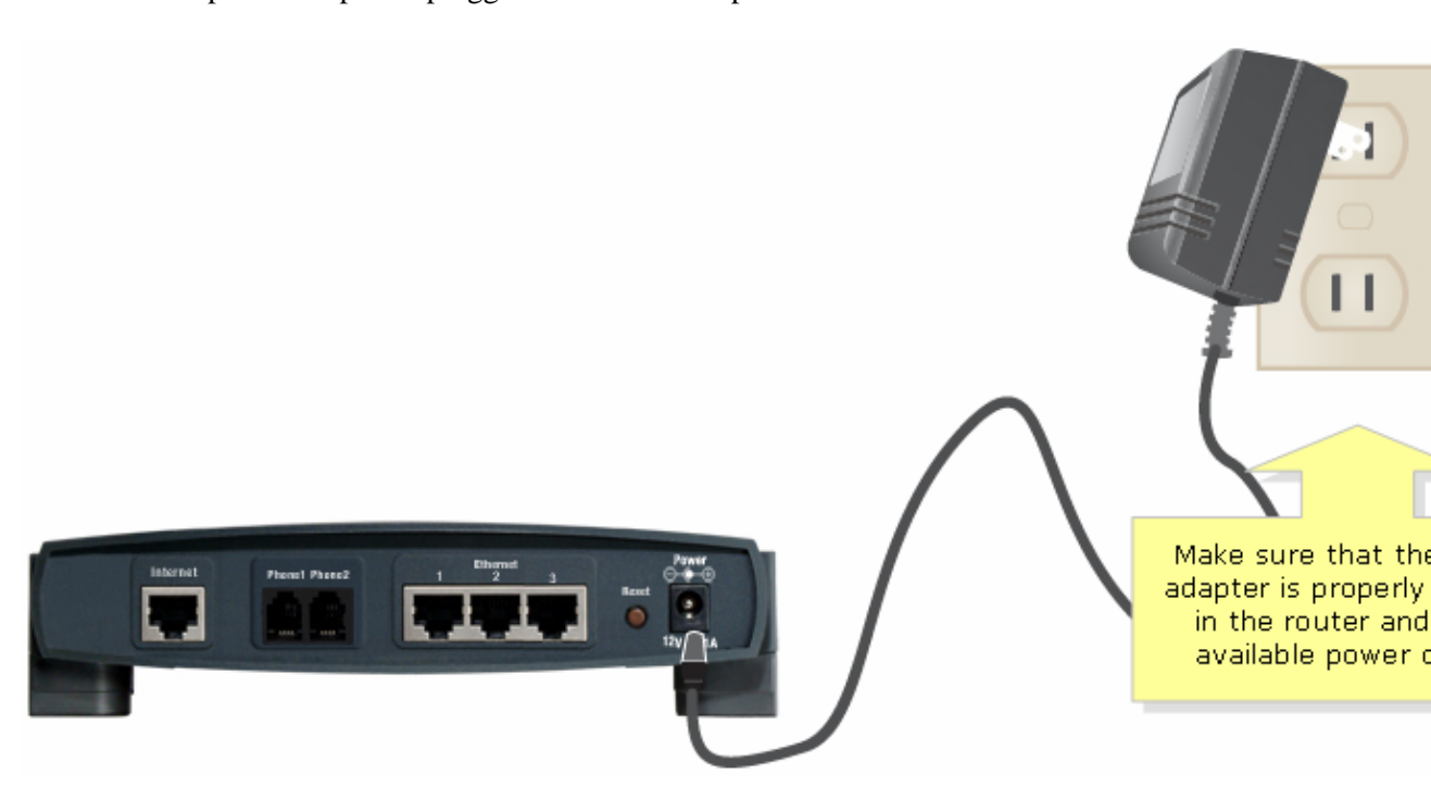
Step 5: Check if the corresponding LEDs on the router are lit.