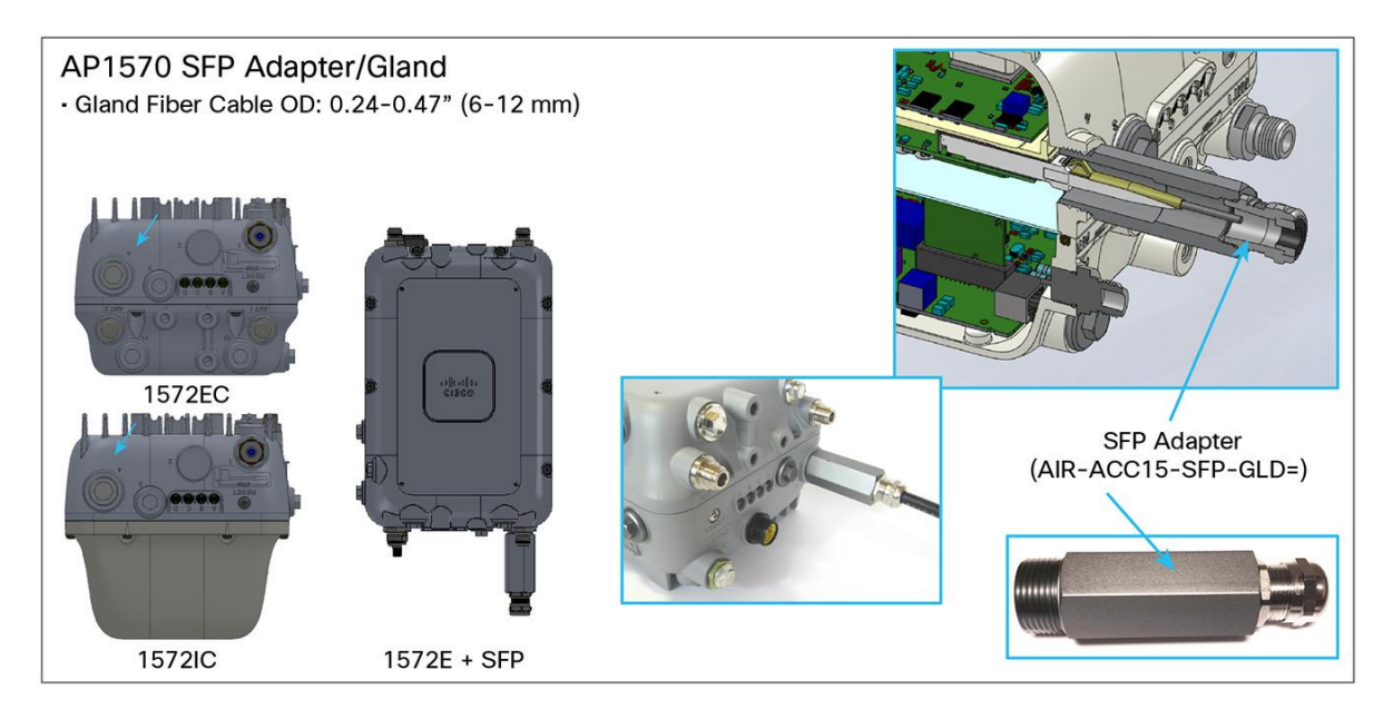
Figure 2. Fitting the Fiber Cable Interface to the AP