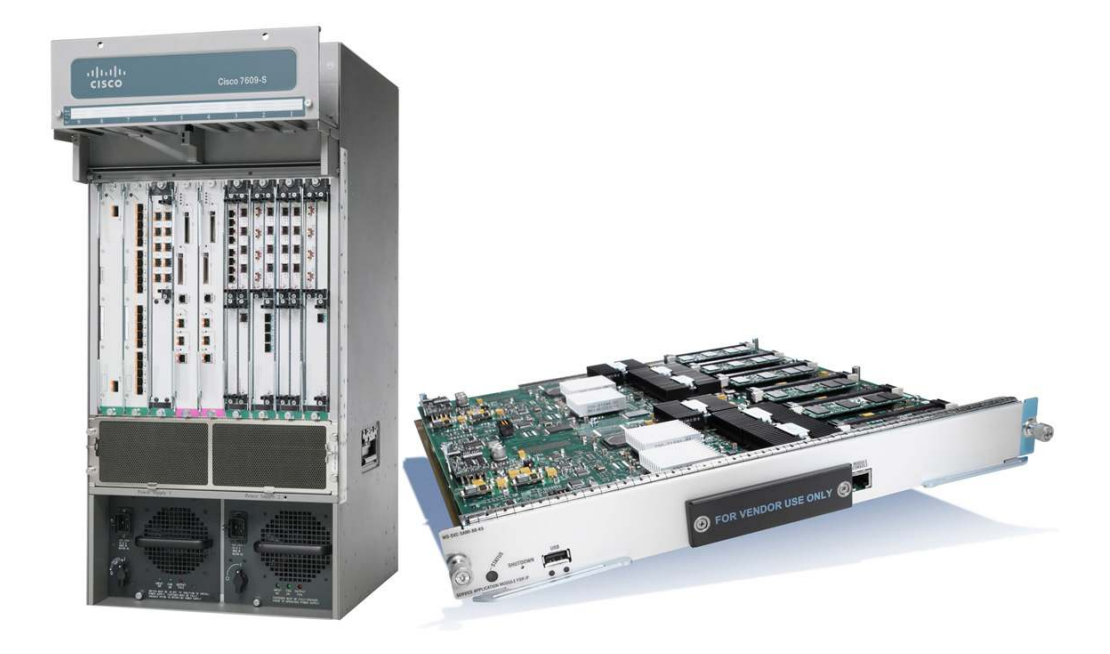
Figure 2. Cisco 7600 Series Router with SAMI Blade

The Cisco 7600 Series Router delivers robust, high-performance IP/MPLS features for a range of service provider edge applications. The physical interfaces supported on the Cisco 7600 Series platform include Fast Ethernet and Gigabit Ethernet, FlexWAN (ATM and Frame Relay), and the new line of Cisco shared port adapter (SPA) and SPA interface processor (SIP) line cards. Each Cisco 7600 Series Router provides Layer 2 connectivity and Layer 3 routing services and can host a variety of specialized applications on the Cisco SAMI module.