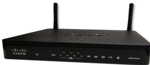
Figure 1. Cisco WRP500 Wireless-AC Broadband Router with 2 Phone Ports