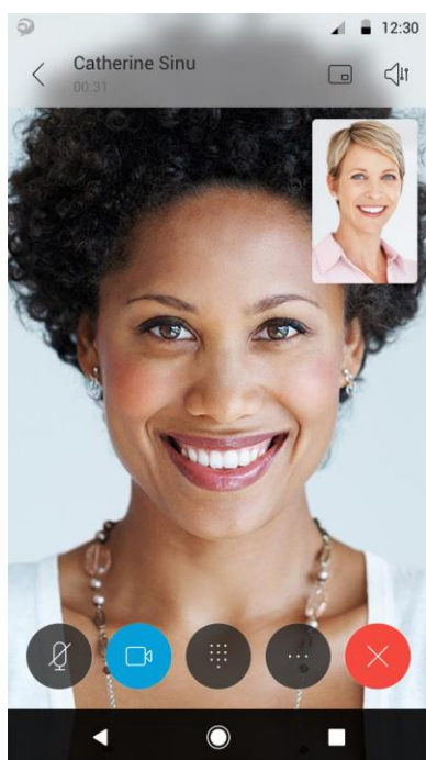
Figure 1. Cisco Jabber for Android (on an Android phone)

The Cisco Jabber mobile client streamlines communications and enhances productivity by unifying presence, messaging, video, voice, voice messaging, file transfer, and conferencing capabilities securely into one client on your mobile device. The solution delivers highly secure, clear, and reliable communications. It offers flexible deployment models and is built on open standards. You can communicate and collaborate effectively from anywhere you have an Internet connection (Figures 1 and 2).