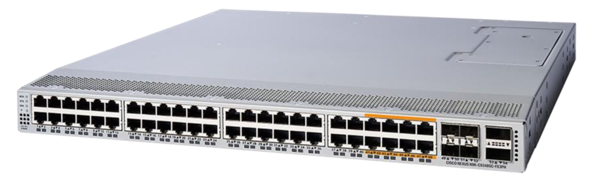
Figure 5. Cisco Nexus 9348GC-FX3PH Switch

The Cisco Nexus 9348GC-FX3PH Switch (Figure 5) is a 1RU switch that supports 696 Gbps of bandwidth and over 517 Mpps. The 40 1GBASE-T downlink ports on the 9348GC-FX3PH can be configured to work as 10-Mbps, 100-Mbps, or 1-Gbps ports. The last 8 downlink ports can be configured to work as 10-Mbps or 100-Mbps only. The 4 ports of SFP28 can be configured as 1/10/25-Gbps, and the 2 ports of QSFP28 can be configured as 40- and 100-Gbps ports, or a combination of 10, 25, 40,and 100-Gbps connectivity, offering flexible migration options. The last 8 ports are only of half-duplex functionality and are limited to 10Mbps and 100Mbps speeds only.