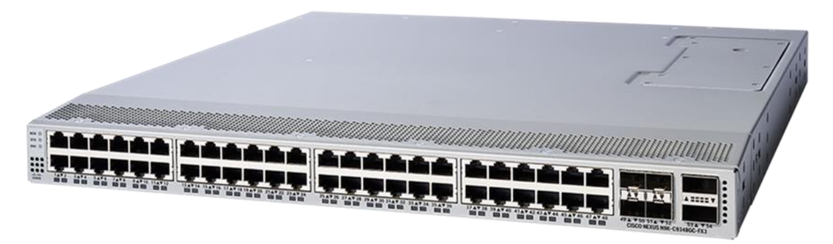
Figure 4. Cisco Nexus 9348GC-FX3 Switch

The Cisco Nexus 9348GC-FX3 Switch (Figure 4) is a 1RU switch that supports 696 Gbps of bandwidth and over 517 Mpps. The 48 1GBASE-T downlink ports on the 9348GC-FX3 can be configured to work as 10-Mbps, 100-Mbps, or 1-Gbps ports. The 4 ports of SFP28 can be configured as 1/10/25-Gbps and the 2 ports of QSFP28 can be configured as 40- and 100-Gbps ports, or a combination of 10-, 25-, 40, 50-, and 100-Gbps connectivity, offering flexible migration options.