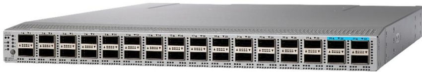
Figure 3. Cisco Nexus 93180LC-EX Switch

The Cisco Nexus 93180LC-EX Switch is the industry’s first 50-Gbps-capable 1RU switch that supports 3.6 Tbps of bandwidth and over 2.6 bpps across up to 32 fixed 40- and 50-Gbps QSFP+ ports or up to 18 fixed 100-Gbps ports (Figure 3). The switch can support up to 72 10-Gbps ports using breakout cables. A variety of flexible port configurations are supported using templates.