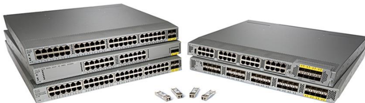
Figure 2. Cisco Nexus 2000 Series Fabric Extenders

The Cisco Nexus 2000 Series Fabric Extenders comprise a category of data center products that provide a server-access platform that scales across a multitude of 1 Gigabit Ethernet, 10 Gigabit Ethernet, unified fabric, rack, and blade server environments. The Cisco Nexus 2000 Series Fabric Extenders are designed to simplify data center architecture and operations by dramatically reducing the points of management and by meeting the business and application needs of a data center. Working in conjunction with Cisco Nexus switches, the Cisco Nexus 2000 Series Fabric Extenders offer a cost-effective and efficient way to support today’s Gigabit Ethernet environments while allowing easy migration to 10 Gigabit Ethernet, virtual machine-aware Cisco unified fabric technologies.