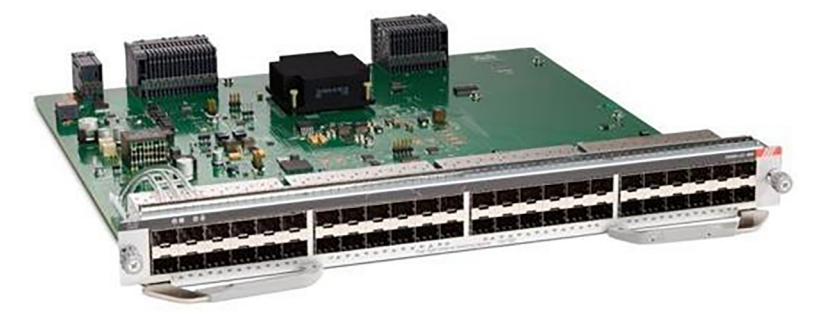
Figure 13. Cisco Catalyst 9400 Series 48-port 1 Gigabit Ethernet (SFP) Line Card (C9400-LC-48S)