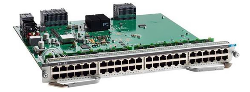
Figure 8. Cisco Catalyst 9400 Series 48-Port UPOE 10/100/1000 (RJ-45) Line Card (C9400-LC-48U)

The Catalyst 9400 Series switch UPOE line card UPOE line card supports PoE, PoE+, and Cisco UPOE to deliver 15W, 30W, or 60W to the access point. 60W of inline power can power more devices—including IP phones, IPTVs, surveillance cameras, virtual desktop clients, and many others—without having to install extra wall or ceiling circuits while taking advantage of standards-based Energy Efficient Ethernet.