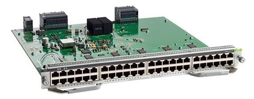
Figure 10 . Cisco Catalyst 9400 Series 48-Port 10/100/1000 (RJ-45) Line Card (C9400-LC-48T)