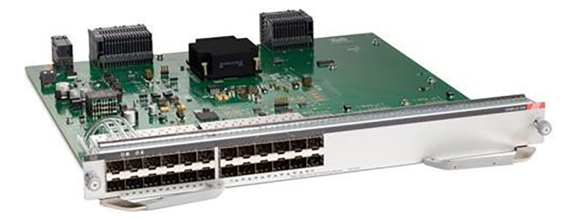
Figure 14. Cisco Catalyst 9400 Series 24-port 1 Gigabit Ethernet (SFP) Line Card (C9400-LC-24S)