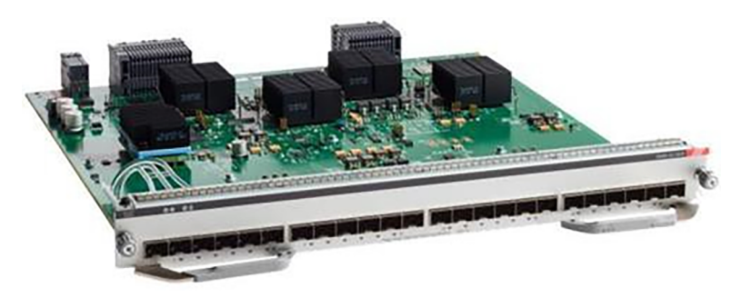
Figure 12. Cisco Catalyst 9400 Series 24-port 10 Gigabit Ethernet (SFP+) Line Card (C9400-LC-24XS)

The Cisco Catalyst 9400 Series 24-port 10 Gigabit Ethernet line card can be deployed for high-performance and high-density 10 Gigabit Ethernet aggregations in the campus and in small to medium-sized networks as a core switch. The Cisco Catalyst 9400 Series 24-port 10 Gigabit Ethernet line card supports standard Small Form-Factor Pluggable Plus (SFP+) optics. The ports can be used interchangeably as Gigabit Ethernet and 10 Gigabit Ethernet to support phased migration from Gigabit Ethernet to 10 Gigabit Ethernet.