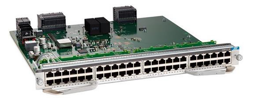
Figure 9. Cisco Catalyst 9400 Series 48-Port PoE+ 10/100/1000 (RJ-45) Line Card (C9400-LC-48P)