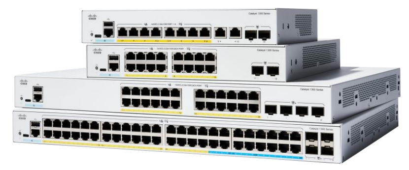
Figure 2. Cisco Catalyst 1300 Series switches

The Cisco Catalyst 1300 Series Switches are fixed, managed, enterprise-class Gigabit Ethernet Layer 3 switches designed for small and medium-sized business and branch offices. These simple, flexible, and secure switches are ideal for deployment out of the wiring closet. The Catalyst 1300 Series operates on customized Linux OS software, with an intuitive dashboard that simplifies network setup and advanced features that accelerate digital transformation, while pervasive security protects business-critical transactions. The 1300 Series switches provide the ideal combination of affordability and capabilities for branches and growing networks and help you create a more efficient, better-connected workforce. When your business needs advanced networking features and security for the digital transformation, yet value is still a top consideration, you're ready for the Cisco Catalyst 1300 Series Switches.