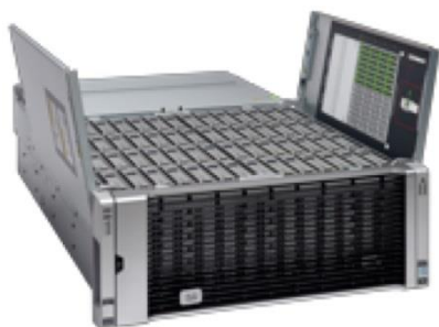
Figure 1. Cisco UCS S3260 Storage Server

The Cisco UCS® S3260 Storage Server (Figure 1) is a modular, high-density, high-availability, dual-node storage-optimized server well suited for service providers, enterprises, and industry-specific environments. It provides dense, cost-effective storage to address your ever-growing data needs. Designed for a new class of data-intensive workloads, it is simple to deploy and excellent for applications for big data, data protection, software-defined storage environments, scale-out unstructured data repositories, media streaming, and content distribution.