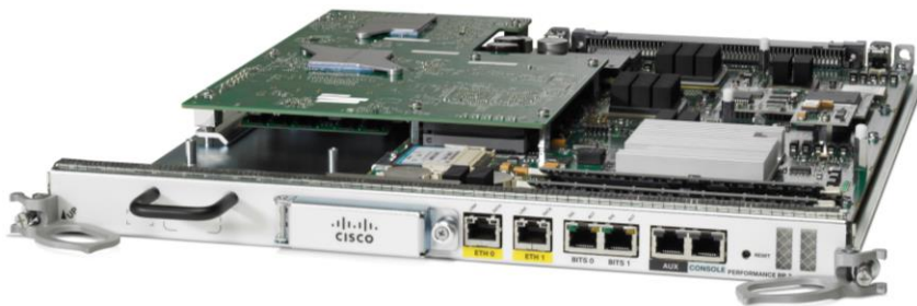
Figure 2. Cisco XR 12000 PRP-3 with PRP3-SMDC Inserted

Cisco PRP3-SMDC adds new capabilities by supporting carrier-grade Layer 3 to Layer 4 services. Services that are not traditionally supported on the Line Card (LC), such as Carrier Grade Network Address Translation (NAT), can now be transparently provisioned on the Cisco PRP3-SMDC. All packets entering the router (LC) that require