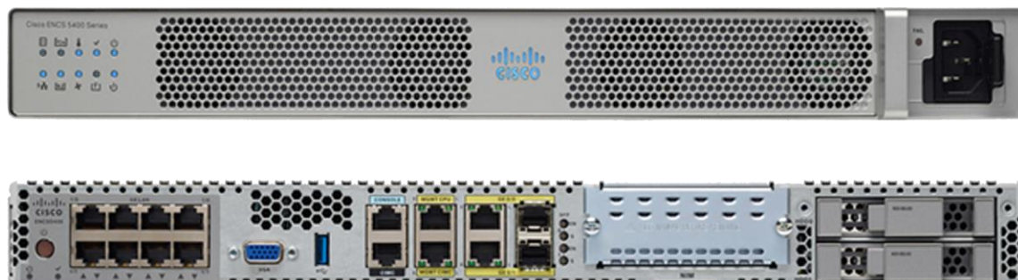
Figure 3. Cisco 5400 Enterprise Network Compute System – Front And Back

Figure 3 shows the front and back of the Cisco 5400 Enterprise Network Compute System platform.