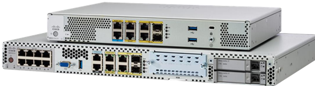
Figure 1. Cisco 5000 Enterprise Network Compute System Family

Figure 1 shows the Cisco 5000 Enterprise Network Compute System family. The Cisco 5400 ENCS (bottom) consists of three models: the 5412, 5408, and 5406.