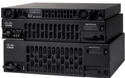
Figure 1. Cisco 4000 Series Integrated Services Routers