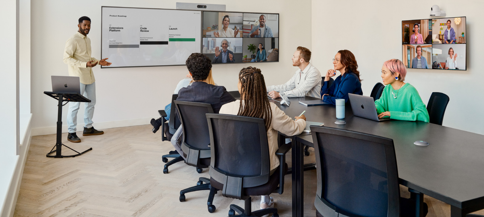
Figure 2. The Cisco Table Microphone Pro used with the extended Cisco Room Kit EQ bundle to provide multi-directional speech pickup from a large meeting room.