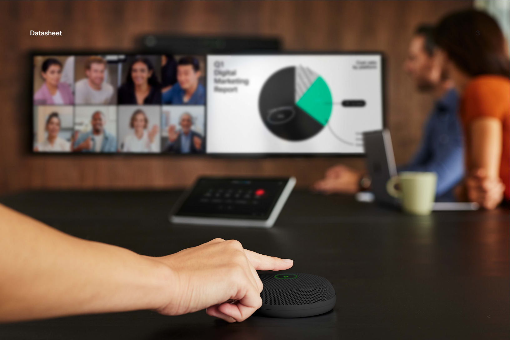
Figure 1. The carbon black Cisco Table Microphone Pro on a meeting room table connected to the Room Bar Pro.