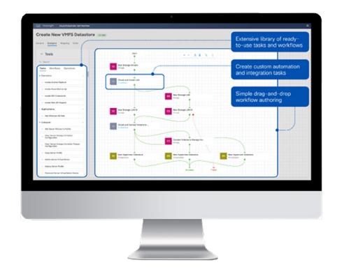
Figure 2. Accelerate delivery of applications and infrastructure using a drag-and-drop automation and workflow designer