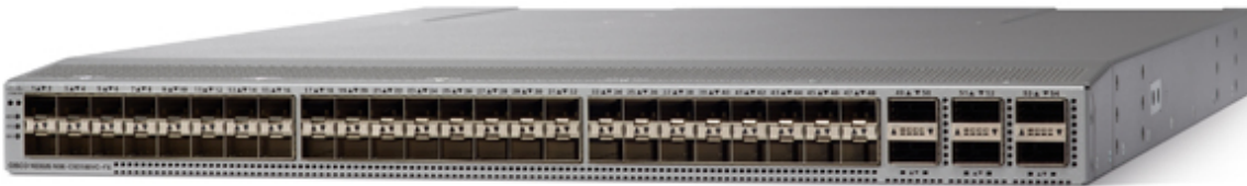
Figure 3. Cisco Nexus 93180YC-FX Switch

Table 2 lists the Cisco Nexus 9300-FX platform switch specifications.