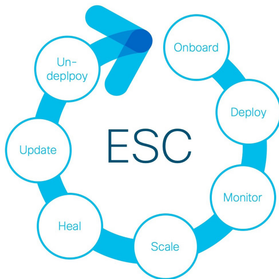
Figure 1 - ESC Lifecycle Stages Framework